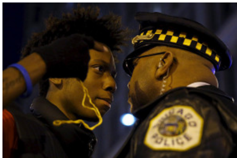
Protesters confront Chicago police during a Nov. 25 demonstration in response to the fatal shooting of Laquan McDonald.